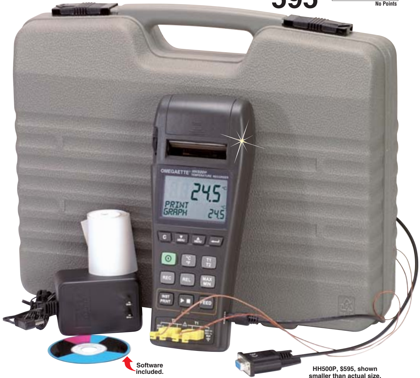
HH500P, $595, shown smaller than actual size.