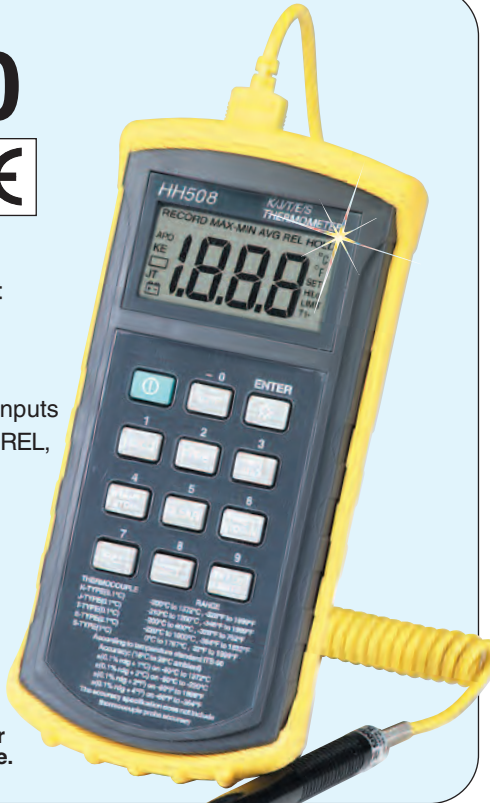
HH508, $110, shown smaller than actual size.

HH508 Single K/J/E/T/S Input Backlit LCD Accepts Type K/J/E/T/S Thermocouple Inputs MAX/MIN, AVG, REL, HOLD Functions Single Input