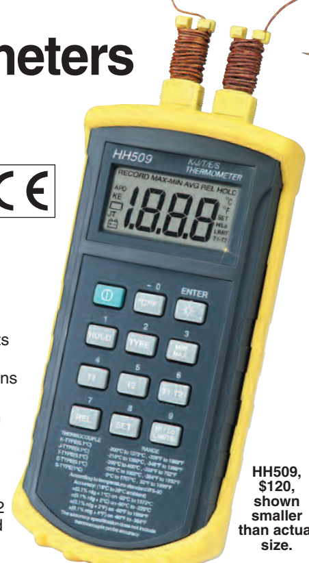
HH509, $120, shown smaller than actual size.

HH509R has all the same features as HH509 plus includes RS232 interface, cable, and software.