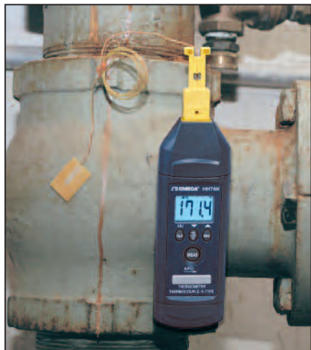
HH74K, $59, shown with optional SA1-K-SC, self-adhesive thermocouple, $75 for package of 5. Visit omega.com/sa1