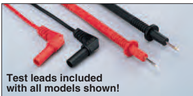
Test leads included with all models shown!

3½ digit, 1999 Counts Digital Display DC Volts: 0 to 2 V/20 V/600 V ±1.2% AC Volts: 0 to 200 V/600 V/50 to 500 Hz ±2.5% DC Current: 0 to 200 µA/2 mA/20 mA/ 200 mA/10 A ±2.5% Resistance: 0 to 200 Ω/2 KΩ/20 KΩ/ 200 KΩ/20 MΩ ±2.0% Resolution: 1 mV, 100 mV, 0.1 µA, 0.1 Ω Battery Test: 1.5 V/9 V ±3.5% Diode Test 10A Fused Safety Input Jacks Safety Test Leads Overload Protection on All Ranges