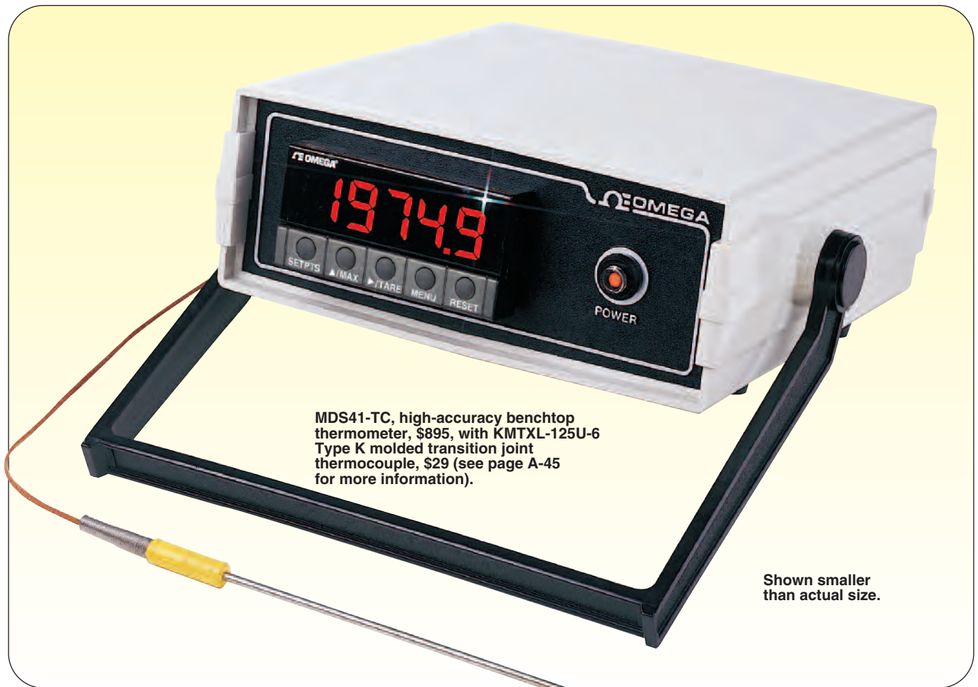
MDS41-TC, high-accuracy benchtop thermometer, $895, with KMTXL-125U-6 Type K molded transition joint thermocouple, $29 (see page A-45 for more information).