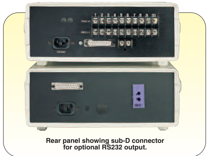
Rear panel showing sub-D connector for optional RS232 output.

Refer to page M-31 in this section for more information on the DP41 series.