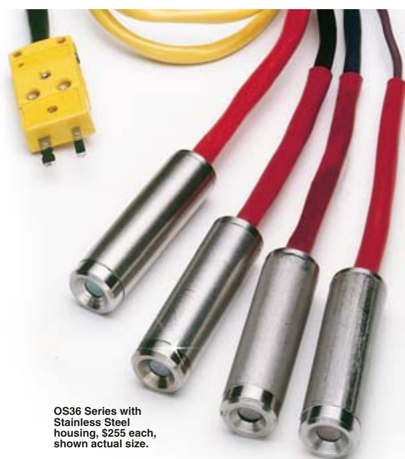
OS36 Series with Stainless Steel housing, $255 each, shown actual size.

Ordering Example: OS36-RA-K-240F, infrared thermocouple, Type K, 95 to 130°C range, right-angle view, stripped lead termination, $255 + 24 = $279.