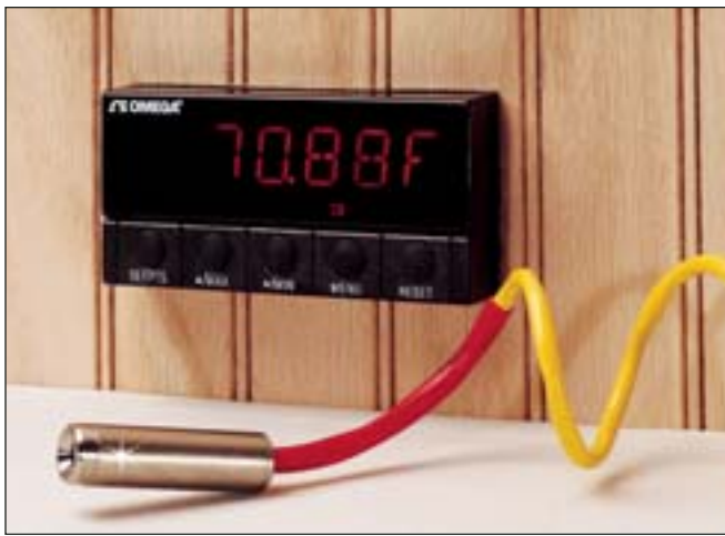
The DP41 thermocouple indicator is a high-accuracy meter, with 0.01° resolution; computer interface and analog/digital outputs are available. See section M for details.