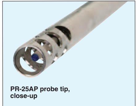
PR-25AP probe tip, close-up

OMEGA® also offers a wide variety of compression fittings, extension cables and measurement and control instruments which allow you to fully customize the system to best meet your measurement and control needs.