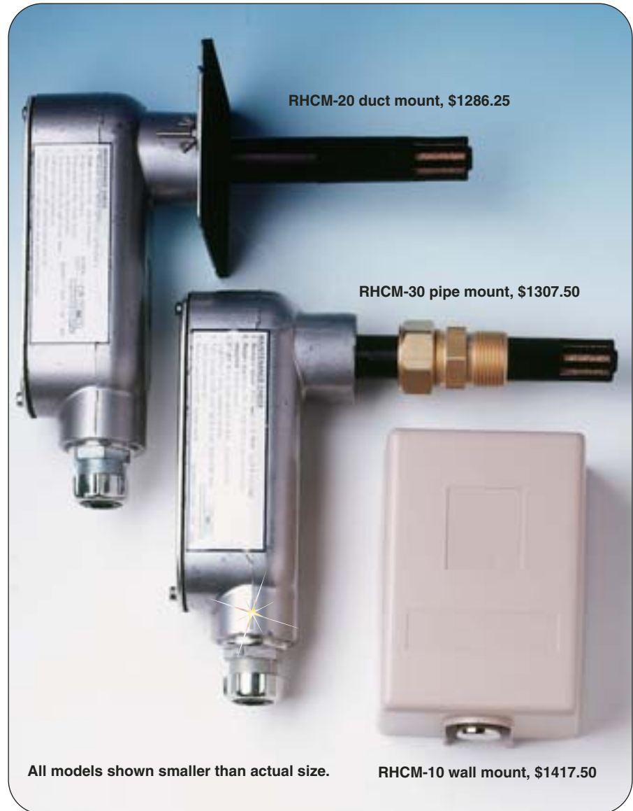
All models shown smaller than actual size.

The RHCM Series offers a wide range of user-specified power inputs including 24 Vdc, 24 Vac, 115 Vac, and 230 Vac, encompassing many applications. The user-specified outputs include 100 Ω Platinum