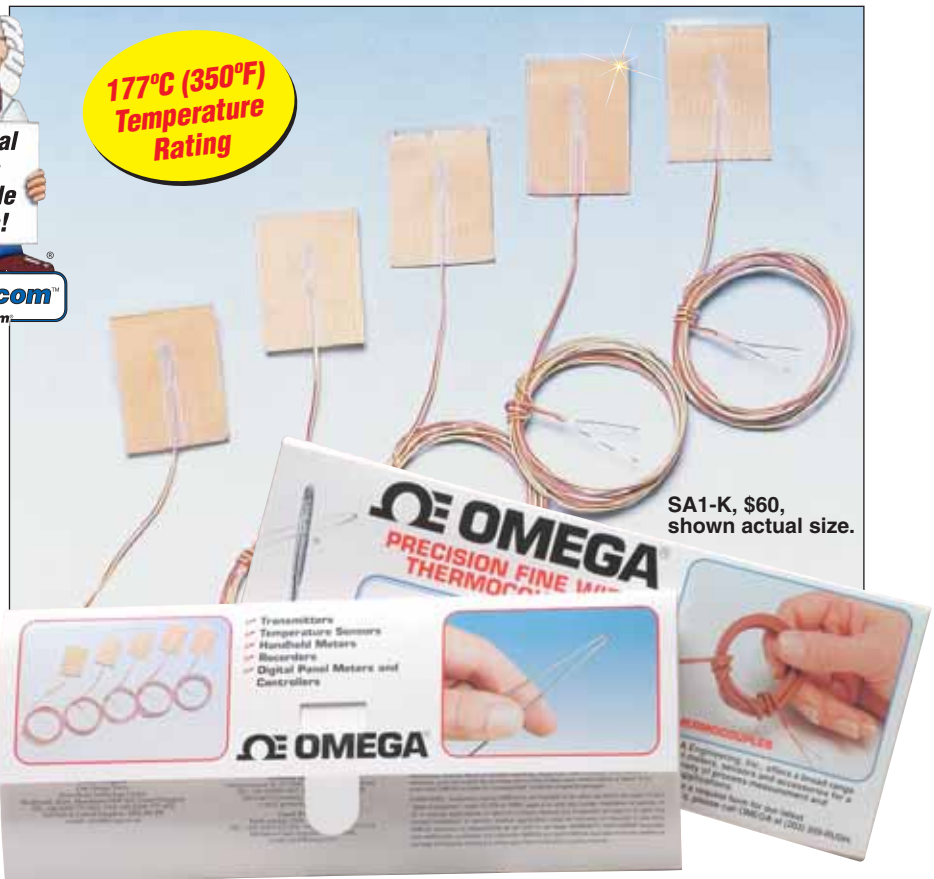
SA1-K, $60, shown actual size.

Wire: 0.9 m (36") leads, 30 AWG PFA coated