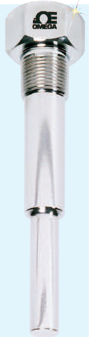
Shown close to actual size.