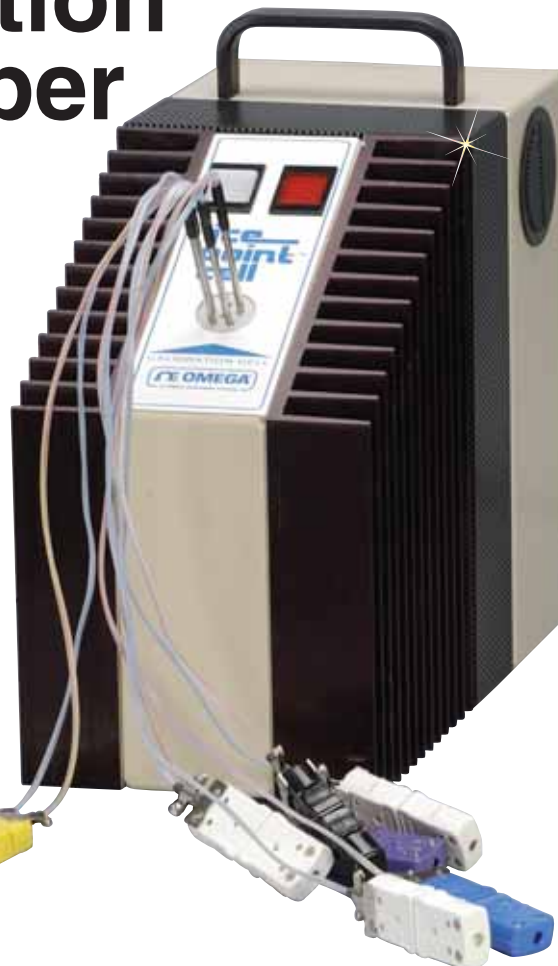
TRCIII, $1175, shown smaller than actual size.

Use up to 6 probes at one time with TRCIII