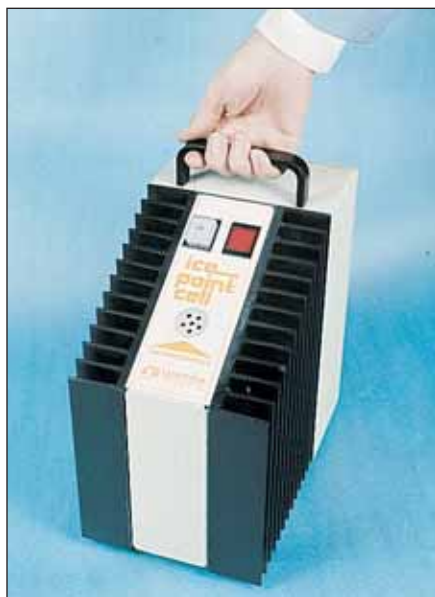
Sturdy handle for easy portability.