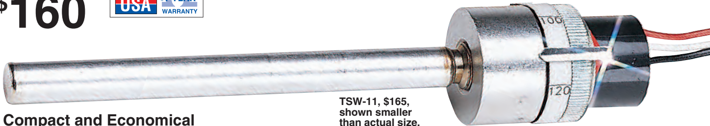
TSW-11, $165, shown smaller than actual size.