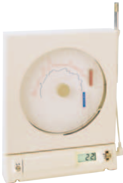
Model CT485B Humidity/Temperature circular chart recorder shown, ($642). See OMEGA's complete line of humidity instruments in Section Hu.

OMEGA's highly accurate, temperature compensated relative humidity calibration standards provide fast, stable, NIST traceable calibrations. All calibration work is performed by highly trained experienced in-house technicians dedicated to providing reliable, quality service at an economical price on most relative humidity sensors, meters, controllers, recorders, dataloggers and data acquisition systems we offer. Contact our Customer Service Department to arrange for these services.