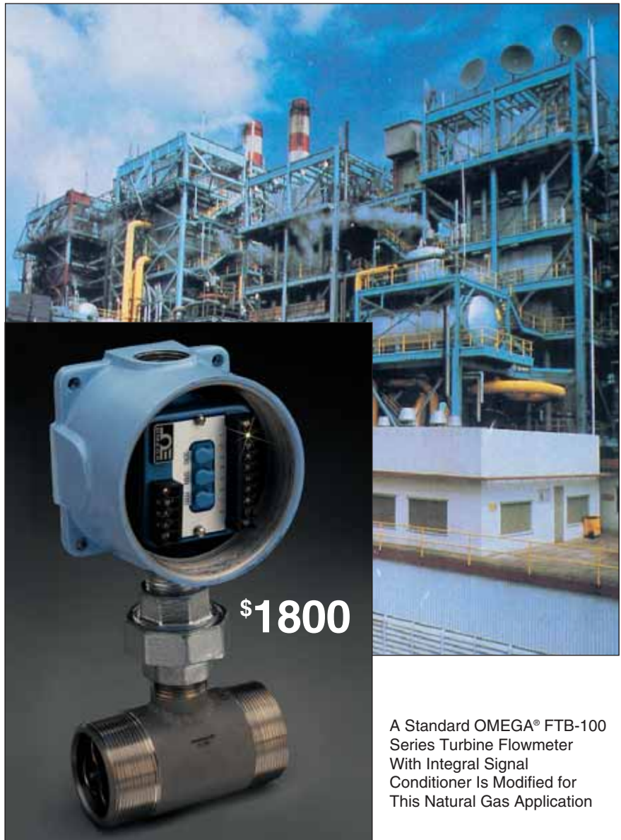
A Standard OMEGA® FTB-100 Series Turbine Flowmeter With Integral Signal Conditioner Is Modified for This Natural Gas Application

PHONE, FAX OR E-MAIL WITH YOUR SPECIAL REQUESTS