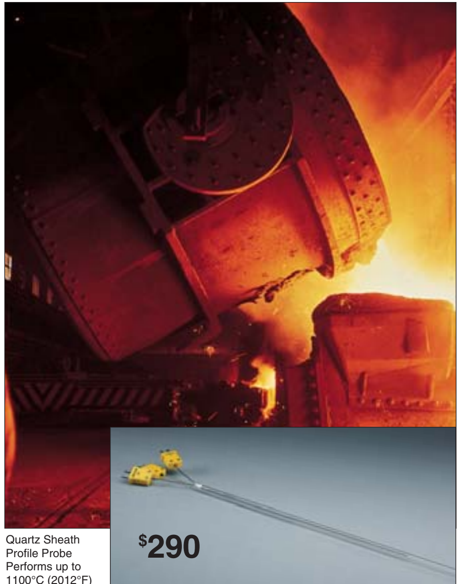
Quartz Sheath Profile Probe Performs up to 1100°C (2012°F)