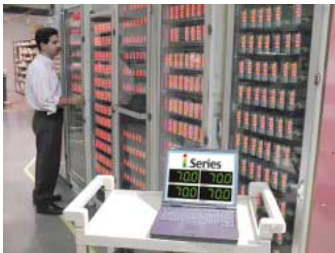
Fig 4 Ovens used to thermally cycle temperature controllers as part of quality assurance testing can be monitored and controlled from anywhere on an Ethernet LAN, from an offsite location, or anywhere else on the Internet.

evening shift. Omega manufacturers process measurement and control devices, including industrial tempera-