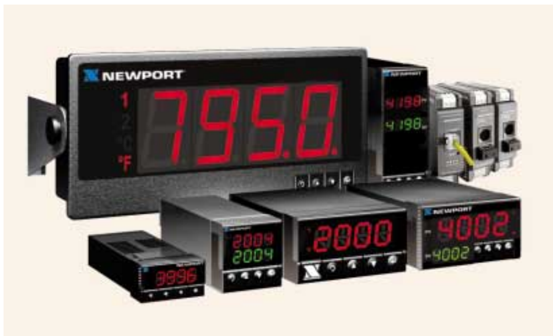
Fig 1 NEWPORT iSeries controllers, signal conditioners, and panel meters

REPRINTED WITH PERMISSION FROM MARCH 2001 INDUSTRIAL HEATING WWW.INDUSTRIALHEATING.COM FOR SUBSCRIPTION INFORMATION/QUESTIONS, CALL: (847)291-5224