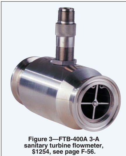
Figure 3—FTB-400A 3-A sanitary turbine flowmeter, $1254, see page F-56.

Sanitary turbine flowmeters, such as the unit shown in Figure 3, are used in processing liquids and beverages. They are also found in applications requiring pasteurization and can be used for thicker materials such as ketchup and chocolate. Units are available in sizes ranging from ¼ to 3" in diameter. This type of sensor covers flow ranges from a fraction of