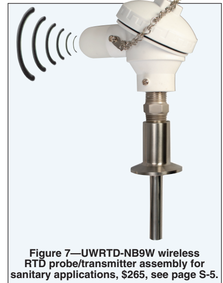
Figure 7—UWRD-NB9W wireless RTD probe/transmitter assembly for sanitary applications, $265, see page S-5.

well as add analytical and control software to improve process control and monitoring. Figure 7 shows an RTD-to-wireless unit that transmits measurements to a matching receiver that can handle up to 48 channels. Matching software logs data and provides process control signals.