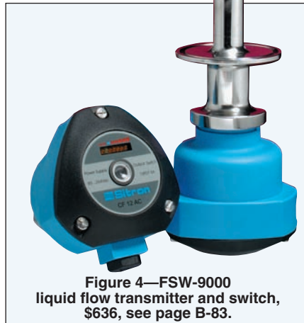
Figure 4—FSW-9000 liquid flow transmitter and switch, $636, see page B-83.

The Model FSW-9000 transmitter/switch shown in Figure 4 monitors the flow velocity of the product based on the principle of thermal dispersion between heated and unheated RTDs immersed in the product. It generates an analog output signal corresponding to the flow rate and includes a set point feature which can signal a process controller or operator when a specified flow is achieved. If an actual flow measurement is not required, a simpler flow switch can be used to signal when the flow rate set point is reached.