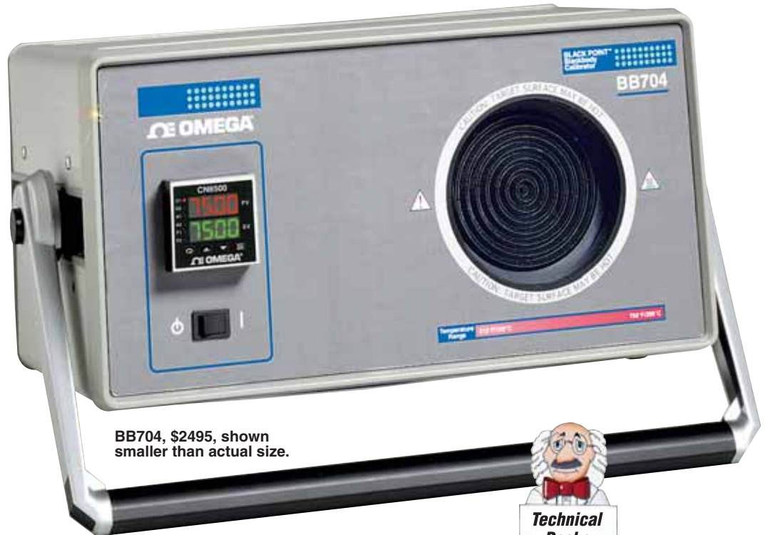
BB704, $2495, shown smaller than actual size.