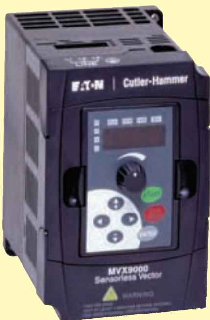
Both shown smaller than actual size.