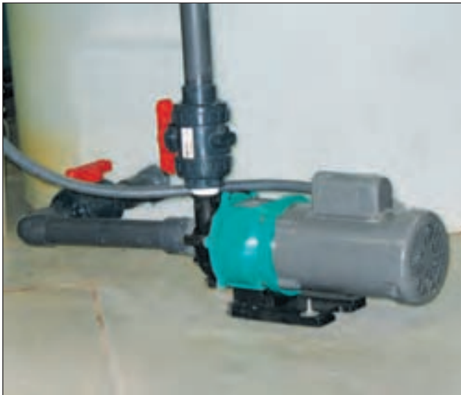
General purpose motor used in transfer pump for water treatment system.

Applications of general purpose motors include turning the blades of a ventilation fan, a water pump or other applications where the torque and speed requirements are within the minimum RPM and load requirement of the original motor design. Otherwise these motors are supplemented by other mechanical drive systems and automation components to achieve the desired result of the process.