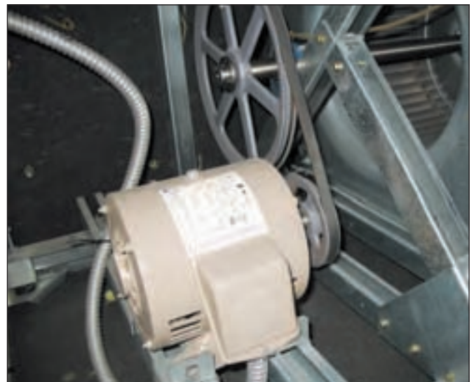
Inverter duty motor application example. The motor shown (above) is enclosed in the large air handling system (below). The motor and VFD control in this system is one of several motors driving and automatically adjusting multiple large forced air system with 14,000 CFM through hundreds of the HEPA filters, providing the appropriate amount of air changes, positive pressure and other environment controls to ensure the operational space contain no more than 10 particles of 0.5 microns in size.