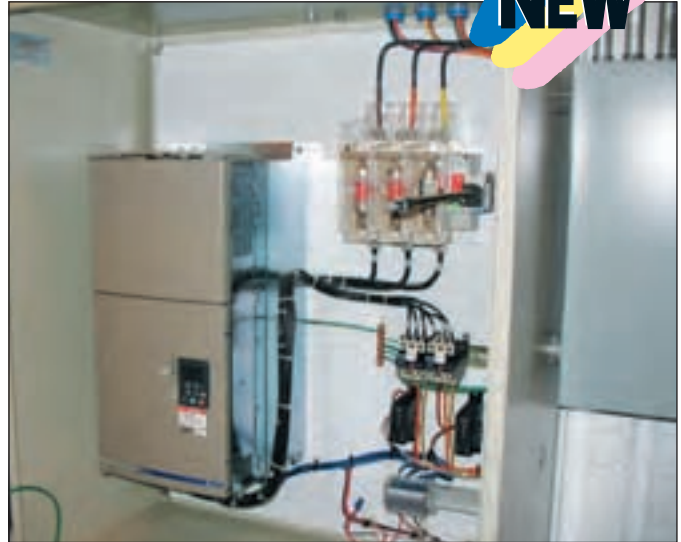
The Variable Frequency Drive (VFD) used to control the inverter duty motor in the air handling system.

Constant torque is a very important factor in applications such as extruders, hoists or conveyors where despite the speed of the motor the torque will remain consistent. Other constant torque applications include reciprocating pumps/compressors and traction drives. Inverter/vector motors are good choices in many machining applications such as lathe turning, milling, grinding and drilling operations. These motors provide the constant horsepower required despite the individual feed and speed specifications of metals or other materials being machined.