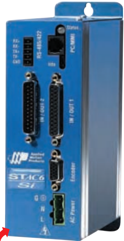
STAC6-Si high performance stepper drive/indexer with integral power supply, $995, shown smaller than actual size.

For stepper motor ordering information see page D-7