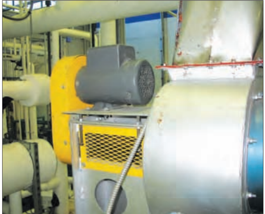
General purpose motors application examples (above and below). Both motors are general purpose with totally enclosed fan cooled enclosure designs and running at a constant RPM. These motors are servicing the exhaust system and pumps in water heating/cooling system while automation components such as valves, temperature sensors and controllers provide the appropriate automated control.

The drive and control mechanisms utilized with general purpose motors can be as simple as a direct shaft, or a more complex pulley belt and gear box system to achieve the speed, torque and other output desired. In carefully designed applications a general purpose motor can be utilized with a Variable Frequency Drive (VFD) to achieve multiple speeds, although this option is most commonly applied to inverter duty/vector duty motors.